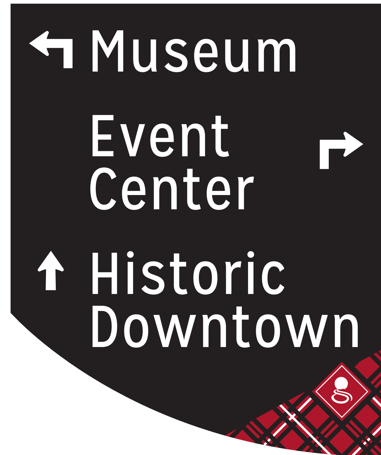
FRONT ELEVATION TEXT WITH DIRECTIONAL ARROW - HWY2 EAST